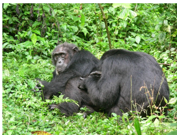
Figure 1 Low ranking adult male chimpanzee grooming a high ranking male at Ngogo.

Exact ages of Ngogo community members are unknown. Adult animals were assigned to the following